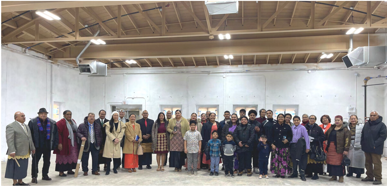
Congregants of the Free Wesleyan Church Of Tonga In Utah preview the new energy efficient bay lights in their gymnasium

Recognizing the opportunity to help families reduce pollution and save money, Guadalupe School worked with Utah Clean Energy to complete home energy efficiency upgrades for students’ families. In all, eight families received smart thermostats, LED lightbulb installs, attic insulation, and air sealing. The more we can empower all Utahns with the tools to save energy and money, the more we can turn the tide on climate change.