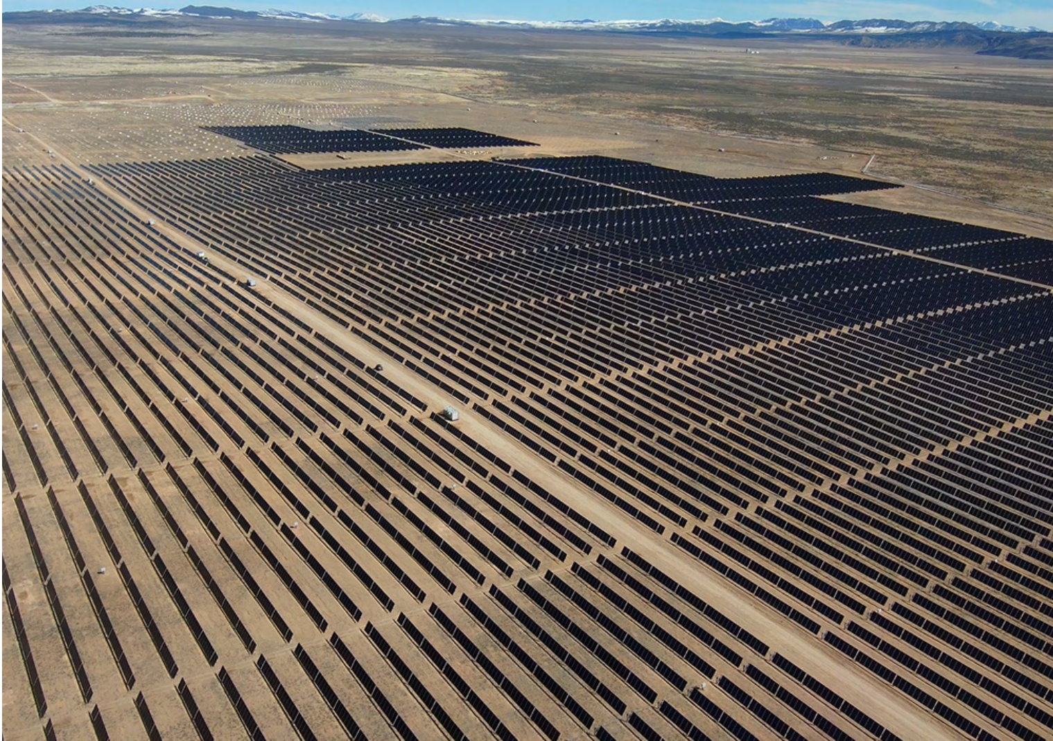
Photo: Appaloosa Solar 1 project in Iron County, Utah developed by rPlus Energies